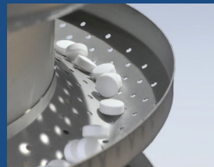
Option: Various helix surfaces available on request