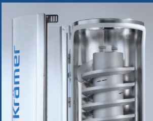
Pivoting and fully removable Window