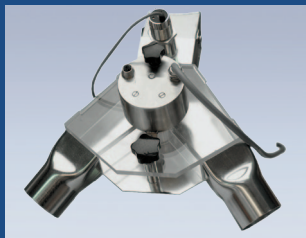
Option: Product Diverter V2000